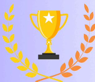
BEST SCIENTIFIC PRESENTATION AWARD- POSTER