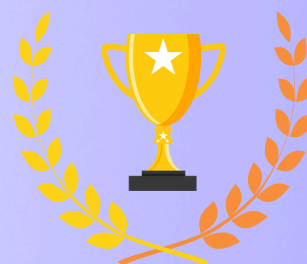
JURY AWARD BEST JUNIOR SCIENTIST LIFETIME ACHIEVEMENT AWARD BEST PERFORMANCE IN SPORTS PROMOTION AND DEVELOPMENT